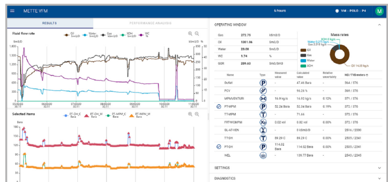
Aspen METTE Virtual Flow Metering User Interface

All of Aspen METTE VFM's features enable early identification of unwanted events, allowing operators to achieve high uptime of their producing wells.