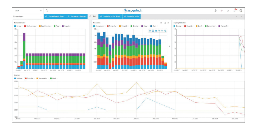
Leverage the Aspen Enterprise Insights hybrid-cloud platform for S&OP/IBP KPI monitoring and workflow enablement.

Publish Aspen Supply Chain Planner data to Aspen Enterprise Insights to enable web-based S&OP/IBP analytics for enterprise-wide reporting and access to data and analysis during the planning process. These capabilities allow you to attain real-time visibility into your current situation by combining data from your ERP and production systems, as well as results from your planning and scheduling tools, for a complete picture of your supply chain.