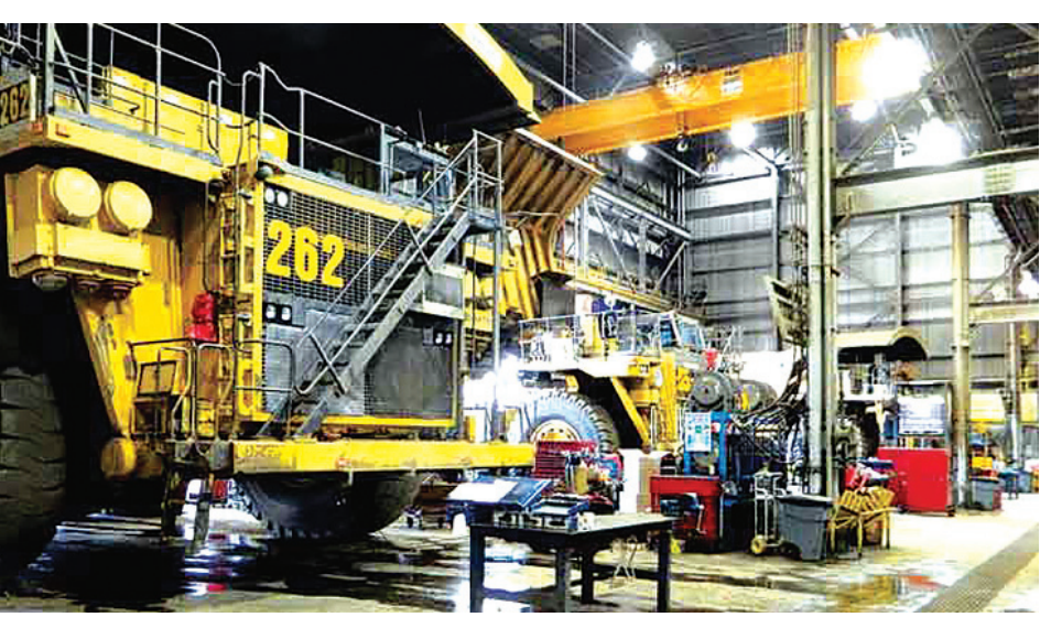
Maintenance programs should include training, procedures and equipment, which promotes proper oil handling and storage techniques to minimize the ingression of airborne dirt and water.

The demands placed upon a lubricant and the operating conditions vary greatly with different components. To protect